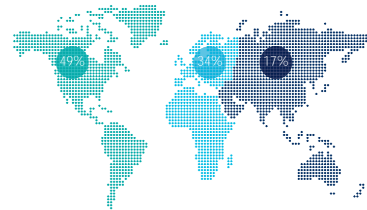
Percentage of sales worldwide